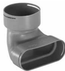
Bend junction 90 to Flat 51