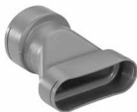
Junction 90/75 to Flat 51