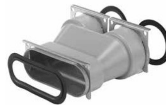
Junction 2x75 to Flat 51